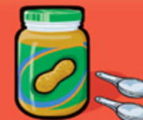
Peanut or nut butters 30 mL (2 Tbsp)