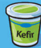
Kefir 175 g (¾ cup)