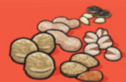
Shelled nuts and seeds 60 mL (¼ cup)