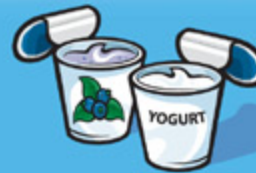
Yogurt 175 g (¾ cup)