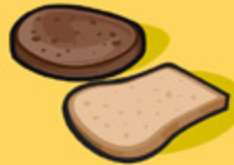
Bread 1 slice (35g)