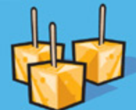
Cheese 50 g (1 ½ oz.)