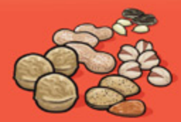
Shelled nuts and seeds 60 mL (¼ cup)