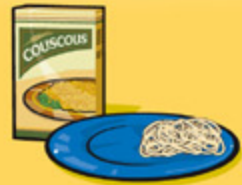
Cooked pasta or couscous 125 mL (½ cup)